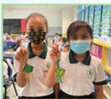
Our students with their ketupats