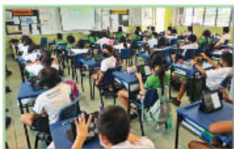
Primary 5 and 6 students creating music on Garageband