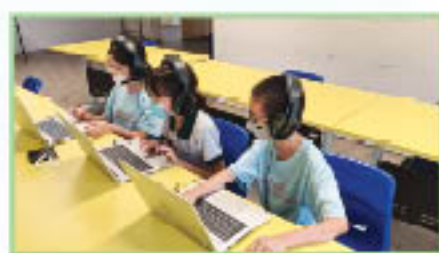
Members participating in Artificial Intelligence (AI) Festival 2022