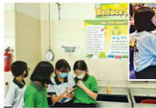
Group 1 members

Two groups of P5 students participated in the National Thinkers Challenge (NTC) 2022, organised by Singapore Hokkien Huay Kuan. They proposed innovative ideas using concepts of design thinking and artificial intelligence (AI), to encourage people to reduce food waste and work towards a Zero Waste Nation. Group 2 from P5-Integrity got into the finals of the competition to work on the design prototype for their presentation in November 2022.