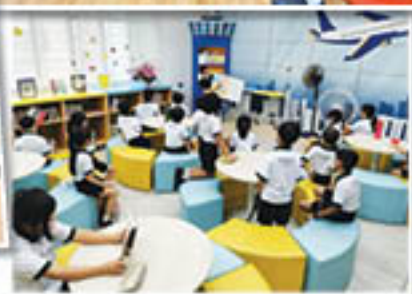
Lower primary students enjoying a storytelling session by our teachers