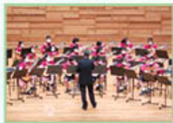
Guitar members enchanting us with their version of Danza Valerio