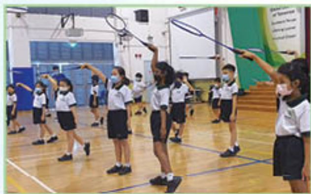
Trying their best to follow the instructions during the Badminton CCA Experience

Our Primary 3 students had an opportunity to experience all the 12 CCAs that the school is offering. Be it sports, performing arts or clubs, students got to try out different CCAs and gather information on the CCAs of their interests. Through this, they can also make more informed choices when selecting their CCA!