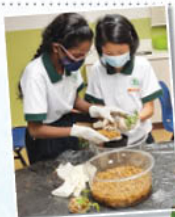
Growing plants using Kokedama techniques and upcycling plastic milk cartons