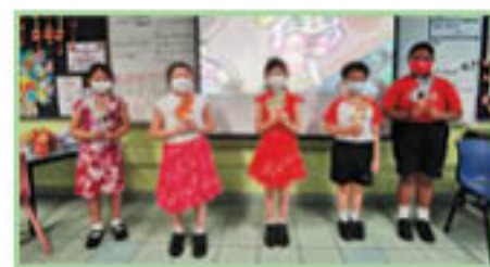
Our students with their Tiger Puppets