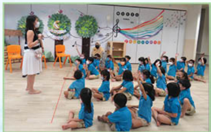
Friendly Meet & Greet session with the Year Heads