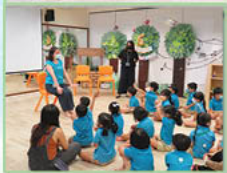
K2 children asking questions and enjoying the sharing by School Leaders