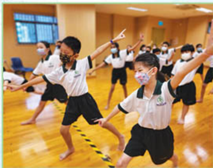
Having fun dancing to an upbeat Bhangra music in Dance CCA Experience