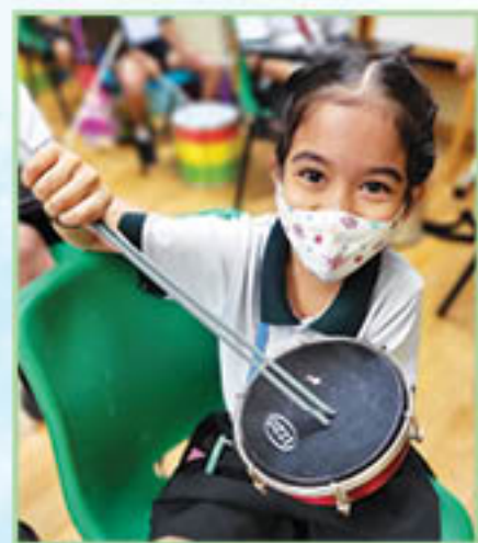
Keeping to the beats in Percussion CCA Experience