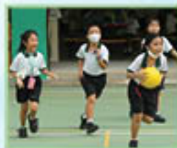
Students coming together to create their own games

Our students are given opportunities to come together to create their own games, develop their sports skills and strengthen relationships with their peers during Play@Recess.