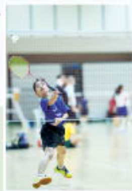
Badminton National School Games