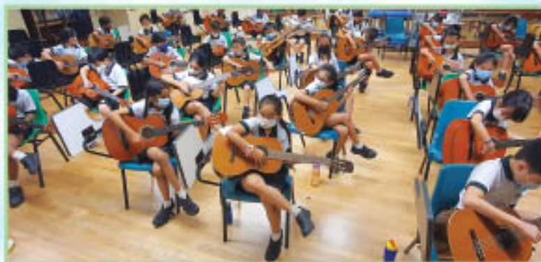
Learning how to play a simple tune during the Guitar CCA Experience