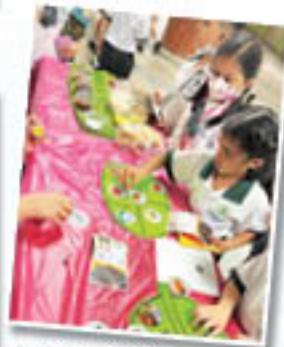
Let's have some delicious Indian food!