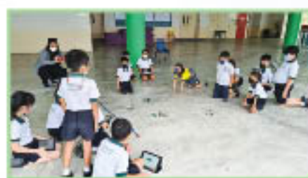
Let's Race our Robotics Cars!

The STEM ALP-Robotics CCA group focusses on developing 21st-century skills in students as they learn to design and programme their robots through block-based programming. This year, we had the opportunity to participate in various national Robotics competitions and events.