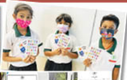
The Tamil Department's programmes aim to pique the interests of students in their appreciation of the language and culture