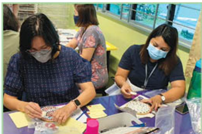
Team bonding through art creation