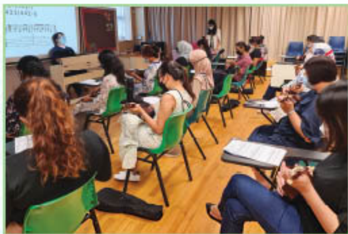
Playing a pop song using the ukulele

The Aesthetics Week gave our teachers a chance to express their creativity as well.