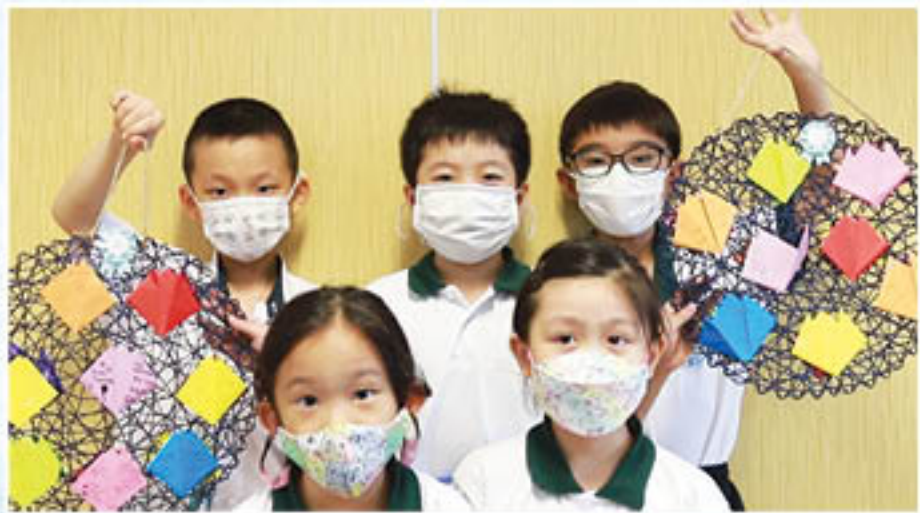
Primary 1 students writing notes of encouragement to the MK children