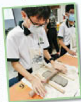
Primary 5 students creating ceramics pieces