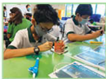
Primary 6 learning 3D printing using 3D pens