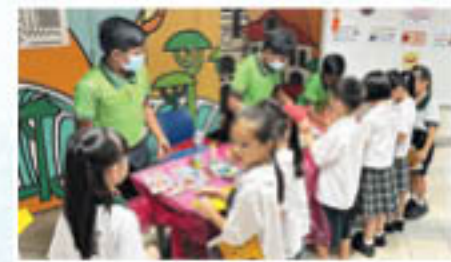
Students making greeting cards