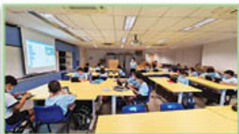
Members using Scratch 3.0 for video game production