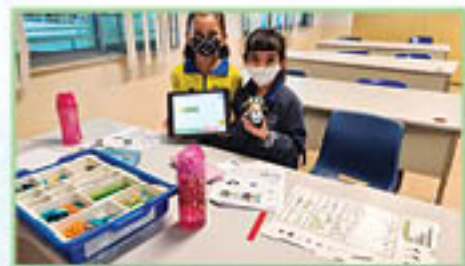
Primary 3 students making their Robotics Green Car through LEGO WeDo 2.0