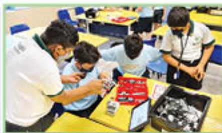
LEGO Mindstorm EV3 Robotics Training for Primary 4 to 6 students