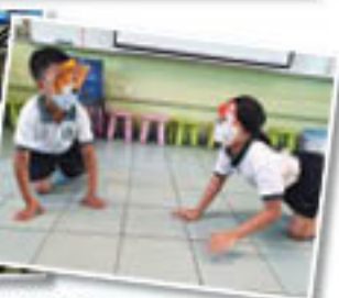
Storytelling and reading programmes to appreciate the Malay language