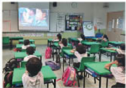
Primary 1 students listening to our MK children's questions about primary school