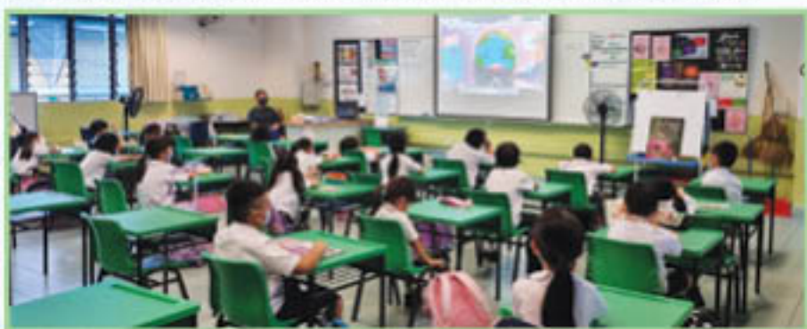
Assembly Talk on Waste Management

Our students took part in the BioBlitz activity as part of the NParks Community in Nature (CIN) initiative, to identify and count as many fauna that can be found in our school garden.