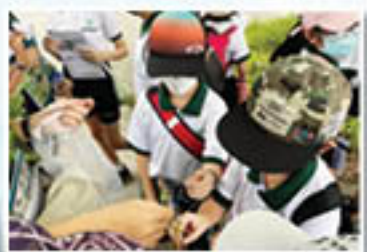
The P5 students went on a learning journey to Gardens by the Bay to learn about the reproduction of flowering plants.