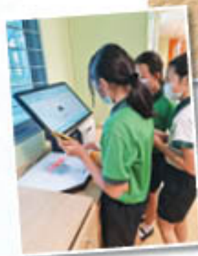
Primary 5 students trying out the self check-out system at the third level library