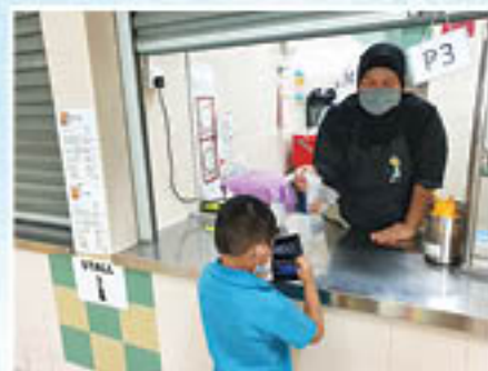
Buying food from the canteen stalls and stationery from the bookshop