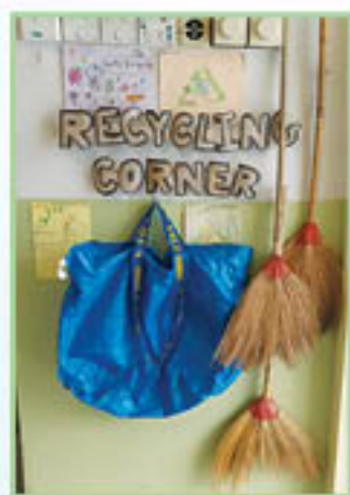
P1 to P6 Recycling Corner Competition