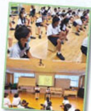
Primary 3 and 4 students learning the cajon and ukulele