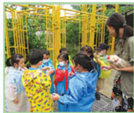
K1 Superb children put on their raincoats and braved the light drizzle as they explored smelling edible mushrooms grown at the farm.