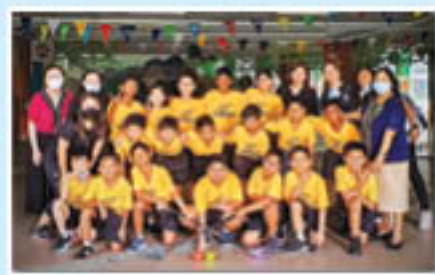
Our Floorball Junior Boys' Team