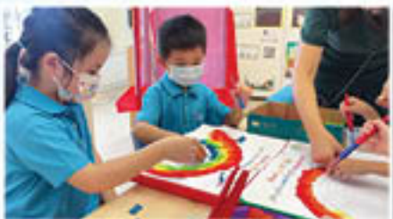
MK children creating a rainbow arch, symbolising hope and future partnership