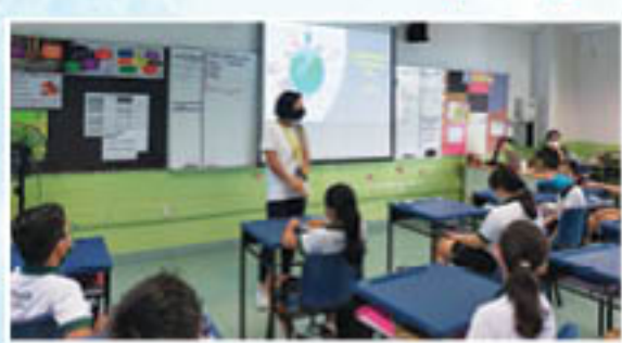
Students learning fun facts about our ASEAN neighbours and the importance of unity amongst our neighboring countries.