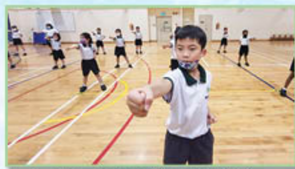
Learning the beauty of Martial Arts in Wushu CCA Experience