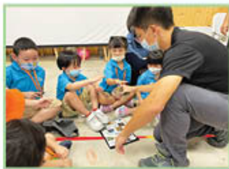
K1 Awesome children experienced touching a quail for the first time.