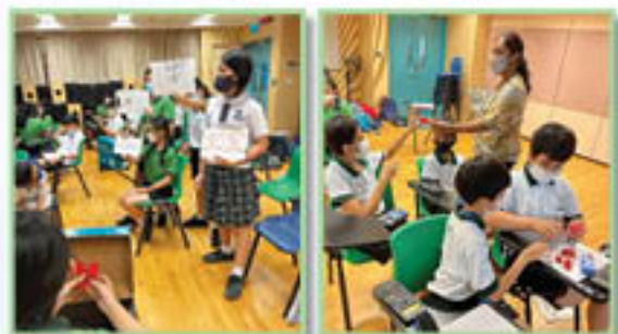
Sharing ideas and different strategies to solve the problems.

The E2K Math and Math Olympiad programmes challenged students to explore Mathematics beyond the core curriculum and build their skills to tackle higher-order thinking questions.