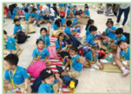
Before embarking on their journey, the K1 Wondrous children having a hearty breakfast. Yum!

On 16 August 2022, the K1 children had close encounters with living things at City Sprouts. This made the children more curious and enhanced positive learning.