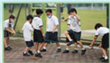
Working together and having fun go hand-in-hand