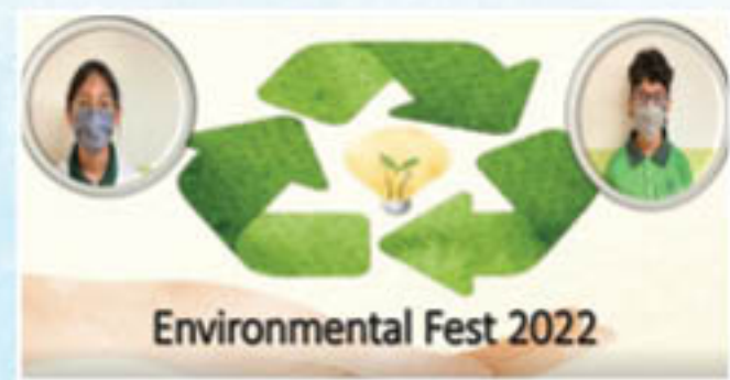
Launching of Environment Fest 2022

This year, our students participate in various environmental programmes and activities.