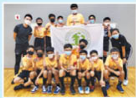
Our Floorball Senior Boys' Team