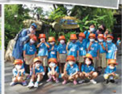
K2 children taking class photographs at the venue.