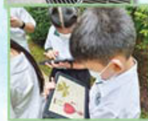
The Primary 3 students had an eco-trail to learn about the diversity of plants in our school eco-garden. They had fun scanning the QR code to find out more about the plants and the different functions of plant parts!