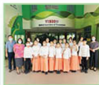
The Guzheng members, seen with our School Leaders, performed a very graceful rendition of the folk song Da Yang Fan Chuan.