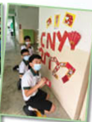
Our students decorating their classrooms and common corridors