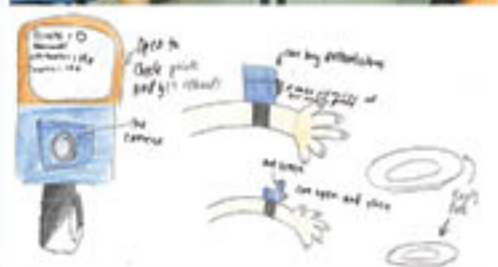
Group 2 members and their design prototype