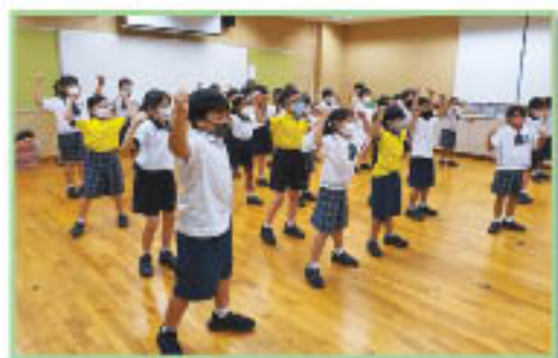
Primary 1 and 2 students grooving to Hip Hop music