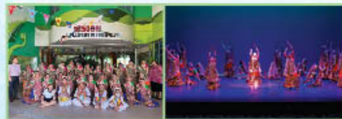
Our Indian Dance members captivated the audience with their powerful performance of the Dandiya Beats.

Three of our Performing Arts groups participated in the SYF Arts Presentation this year. They braved through countless practices to perfect their craft and performed gracefully on stage. Their mesmerising performance received much positive feedback and they have done the school proud.