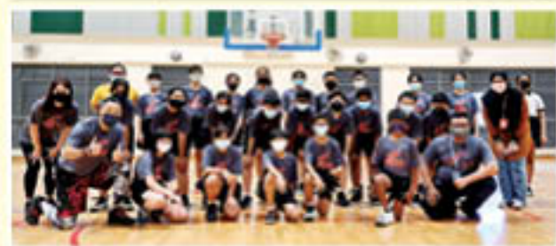
Basketball Senior and Junior Boys' and Girls' Team