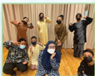
All set to perform on stage!