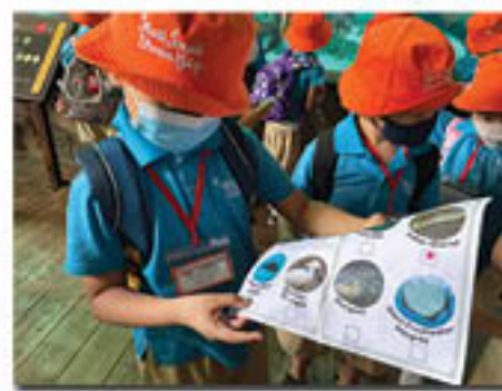
Using an activity booklet to identify the different animals at River Wonders