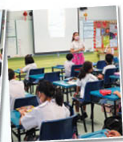
Teachers using the Kindsville Booklets to engage our students in learning how everyone can contribute to the Six Pillars of Defence