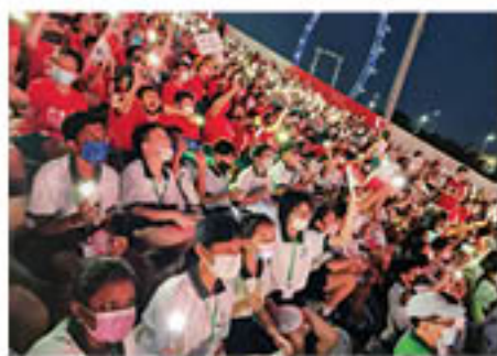
Our Primary 5 students attending the NE Show after a two-year hiatus! What great fun!