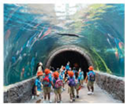
Looking up in wonderment at the beautiful species and scenery