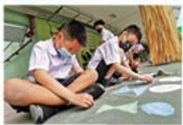
Pavement art by our young artists

The Aesthetics Week gave the students a chance to experience, explore and express their creativity.